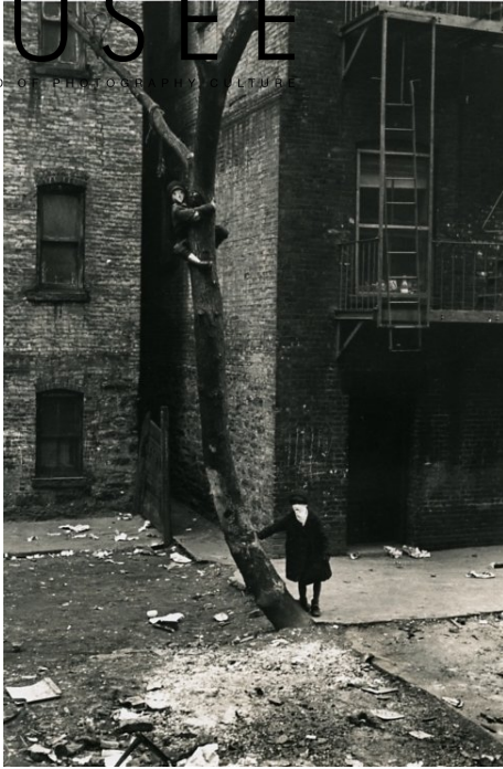
Helen LEVITT (American, 1913-2009) New York, 1938, (boys up tree)

Conversely, Levitt style is much more cinematic in its characteristics. Deeply influenced by surrealism and silent film, Helen Levitt (1913-2009) also explored the uncanny elements of everyday life, often focusing on the interactions and relationships between people, particularly children at play. Her images portray a sense of spontaneity, humor, and humanity.