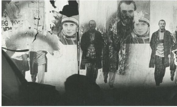
Louis FAURER (American, 1916-2001) New York, NY, ca. 1980