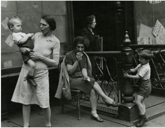
Helen LEVITT (American, 1913-2009) New York, ca. 1945