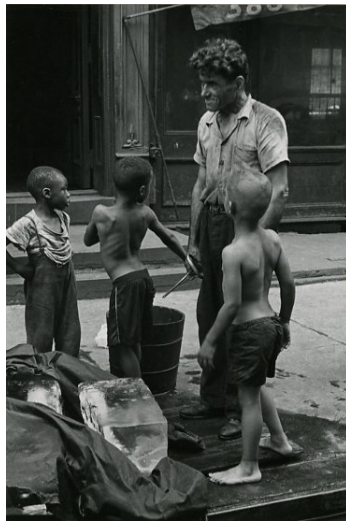
Helen LEVITT (American, 1913-2009) New York, ca. 1940

Conversely, Levitt style is much more cinematic in its characteristics. Deeply influenced by surrealism and silent film, Helen Levitt (1913-2009) also explored the uncanny elements of everyday life, often focusing on the interactions and relationships between people, particularly children at play. Her images portray a sense of spontaneity, humor, and humanity.